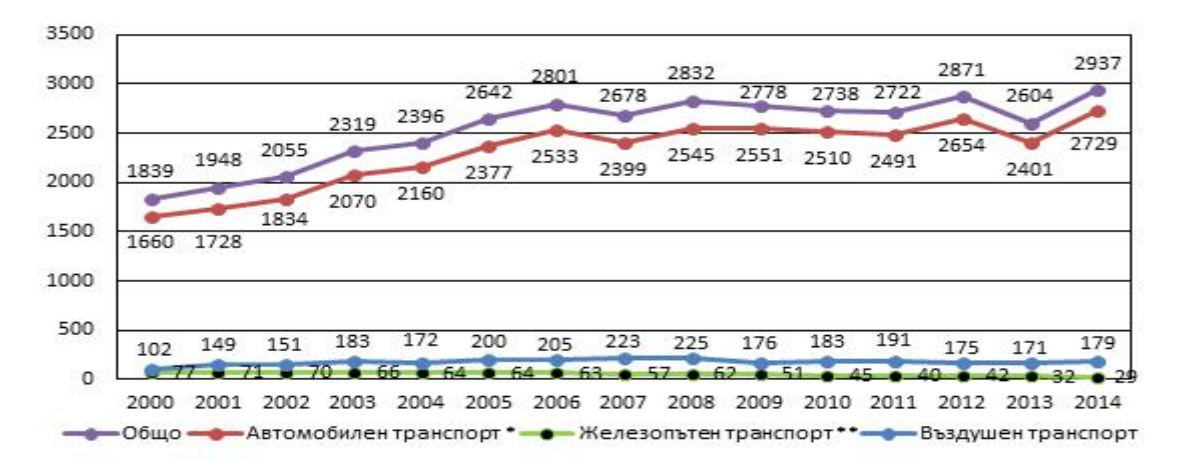
Fig. 1 Final energy consumption in toto* and by transport type** over the period 2000 – 2014 (thousand tonnes of oil equivalent)

[Key: Общо = Total; Автомобилен транспорт = Road transport; Железопътен транспорт = Rail transport; Въздушен транспорт = Air transport]